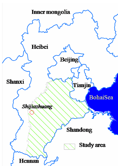
Figure 1. The location of study area in Hebei Province, China